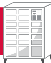
AXCESS 6019.4h 4-High 19-Door Locker Height: 1372 mm Weight: 141 kg