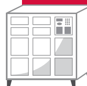
AXCESS 6010.3h 3-High 10-Door Locker Height: 1067 mm Weight: 109 kg