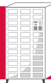
AXCESS 6034.6 34-Door Locker Weight: 245 kg