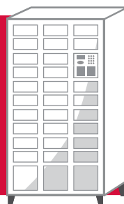
AXCESS 6031.6h 30-Door Locker Weight: 220 kg